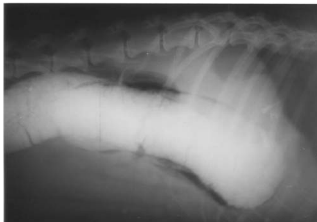
Figure 1. Radiographic image of markedly dilated colon in a dog with idiopathic megacolon

Abdominal radiography of all examined dogs showed colonic distension with stool retention. Markedly dilated colon with a diameter up to 20-30 cm was evident on all radiographic images (Figure 1). In most cases, enlarged colon extended from the epigastric region to the pelvic canal.