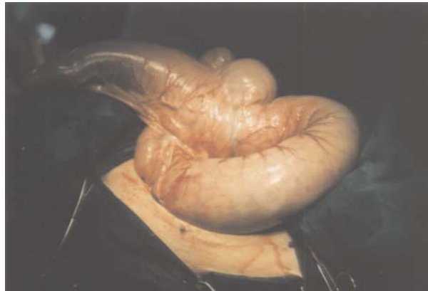
Figure 3. Gross appearance of megacolon before colonotomy followed by manual extraction of faeces

Following a ventral midline laparotomy, the intraoperative diagnosis of megacolon was established based on the presence of a markedly dilated colon, filled with hard faecal masses. Subsequently, the longitudinal colonotomy with manual extraction of faeces was performed. Some details regarding the surgical intervention are shown in Figure 3.