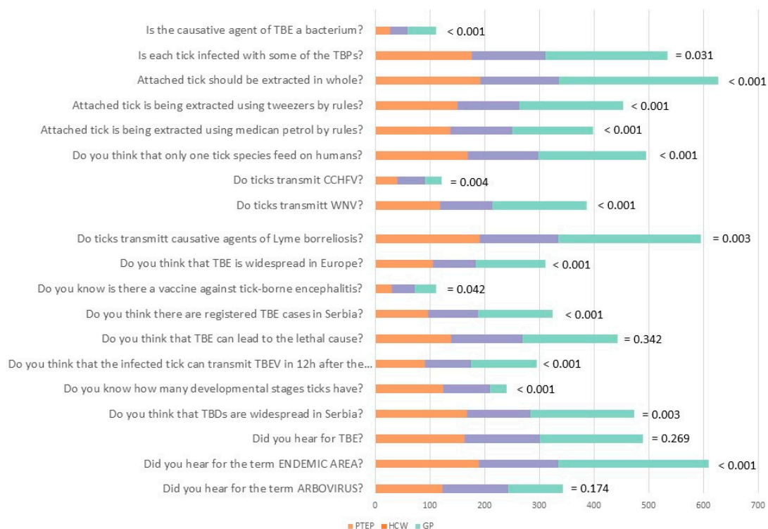
Figure 1. Questions on the knowledge and opinion towards ticks and tick-borne diseases and the answers of the participants from the three different groups.